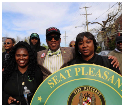
Seat Pleasant Staff