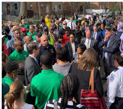
Eastern Avenue walk attendees