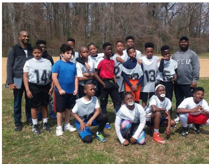
PAL Participants posing for a picture after their first win of the season

Last year, the Seat Pleasant Police Department was awarded a grant through the U.S Department of Justice National Association of Police Athletic/ Activities League Inc. Mentoring Program (N-Pal).