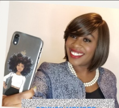
COUNCILMEMBER- AT-LARGE SHIREKA MCCARTHY