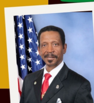
Mayor Kelly Porter