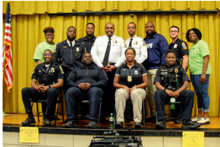
Seat Pleasant Police Department at the Autism Conference