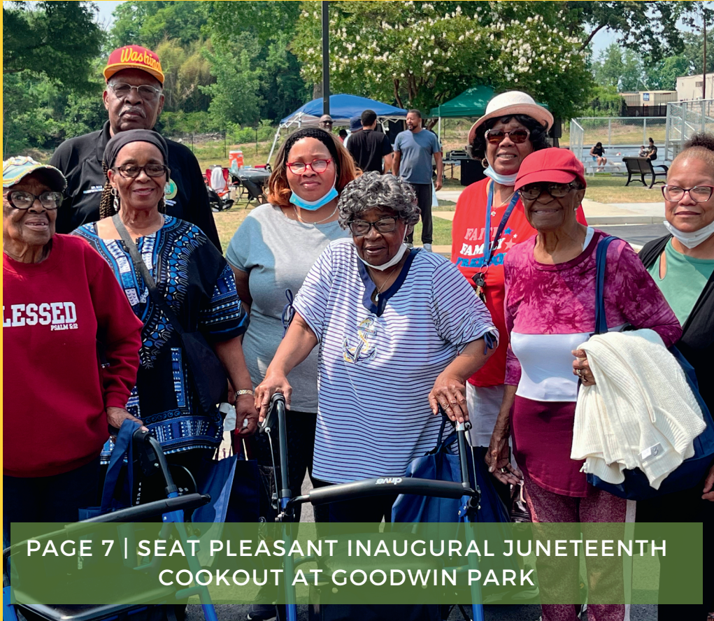
PAGE 7 | SEAT PLEASANT INAUGURAL JUNETEENTH COOKOUT AT GOODWIN PARK