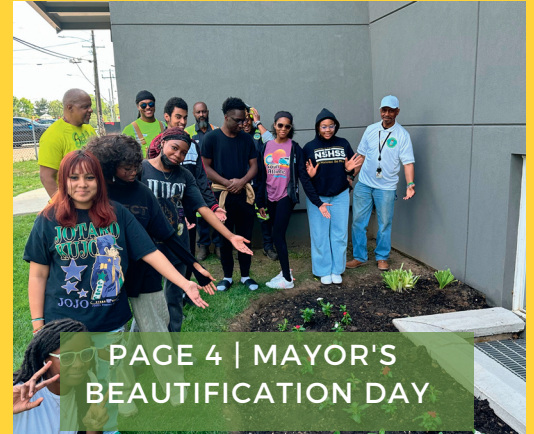
PAGE 4 | MAYOR'S BEAUTIFICATION DAY